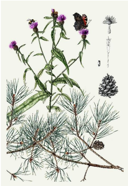
Illustration by Alison